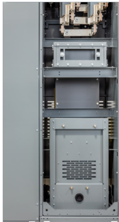
Rear view of the MCC Main unit, reveals new patented design tested to withstand and control the high explosive pressures of a line side arc flash event.