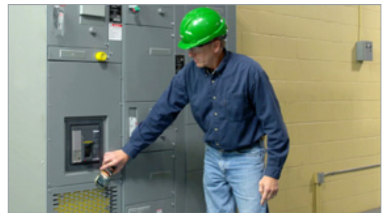
Reading the NFC (Near Field Communication Tag) on the equipment provides access to the mobile app while wearing minimal PPE