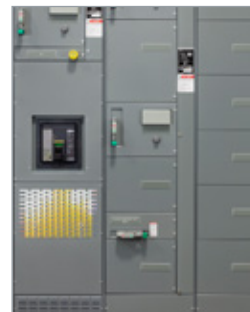
ArcBlok MCC Arc Flash Event: 100kA @ 480V