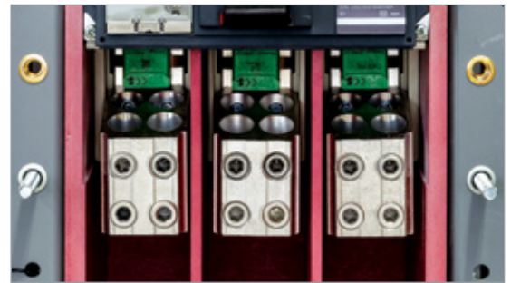
Temperature sensors can be read remotely without exposure to the line side conductors

Using Zigbee communication protocols, you can monitor main breaker operating temperatures on your wireless device. Schneider Electric's goal is to move away from reliance on PPE and administrative controls to more effective engineering controls and technology solutions.