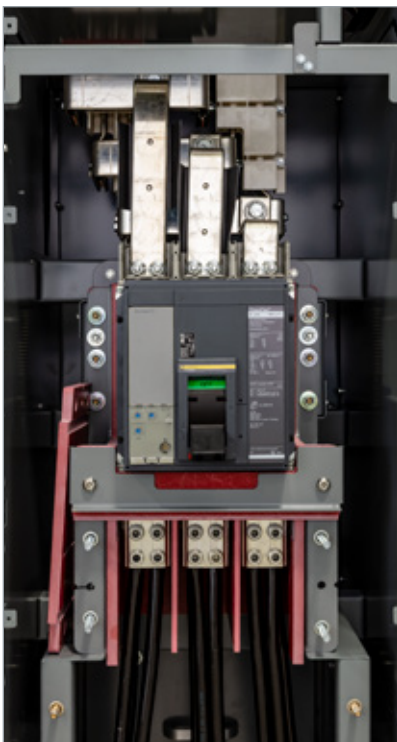
Newly redesigned MCC interiors include a robust enclosure to contain and extinguish Arc Flash events for the line side conductors