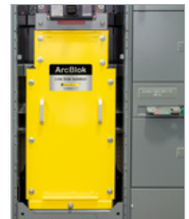
Cable vault is designed to isolate arcs on the line side conductors